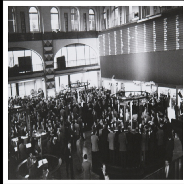
Palazzo Mezzanotte Sala delle Grida, 1960s

Sala delle Grida Trading session in Palazzo Mezzanotte