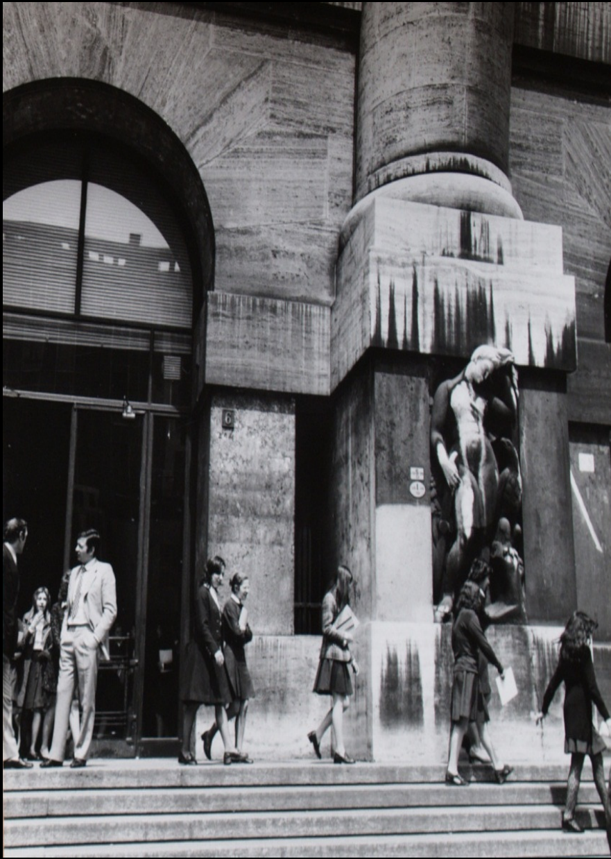
Left: Palazzo Mezzanotte